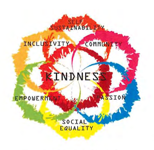
Every day you become a better parent!