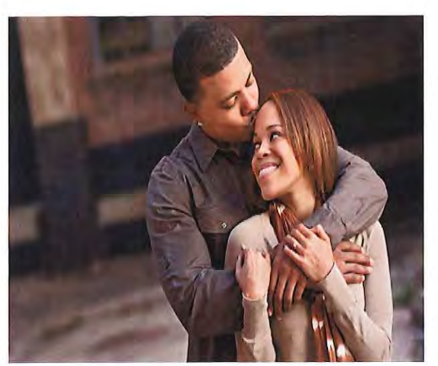
Every day you become a better parent!